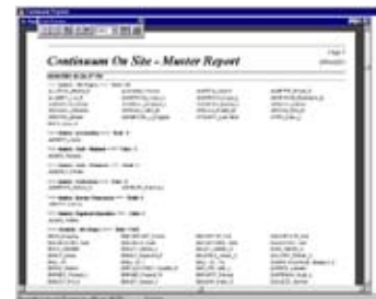
Report by Area & Dept.