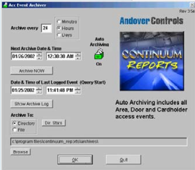
Access Event Archiver