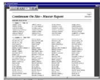
Report by Area

Using an easy to use “point-and-click” on-screen interface, you can quickly configure and set up the areas for which to display and print reports. Your settings can be conveniently saved to a file for future regular use, and for unattended printing or automatic launching. For example, a muster report of who is in the building can be automatically displayed when a fire alarm is tripped.